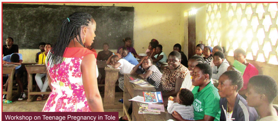
Workshop on Teenage Pregnancy in Tole

Teenage pregnancy has been around for countless years, mostly caused by socio-cultural norms that encourage early marriages, ignorance of reproductive sexual health, myths and misconceptions about contraceptives, poverty and low self-esteem.