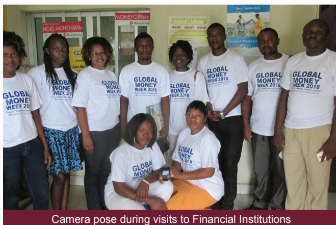
Camera pose during visits to Financial Institutions

Some youth groups that participated in the event were the Youth Empowerment Actors, Grooming Grounds for Female Legends, Association to Improve the Status of the Cameroonian Woman and more. At the end of financial education exercises, participants shared their views during evaluation.