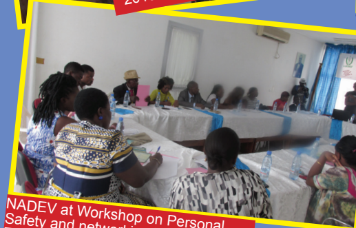
NADEV at Workshop on Personal Safety and networking in conflict Zones