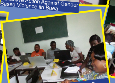
Staff Capacity Building on Microsoft Project Management