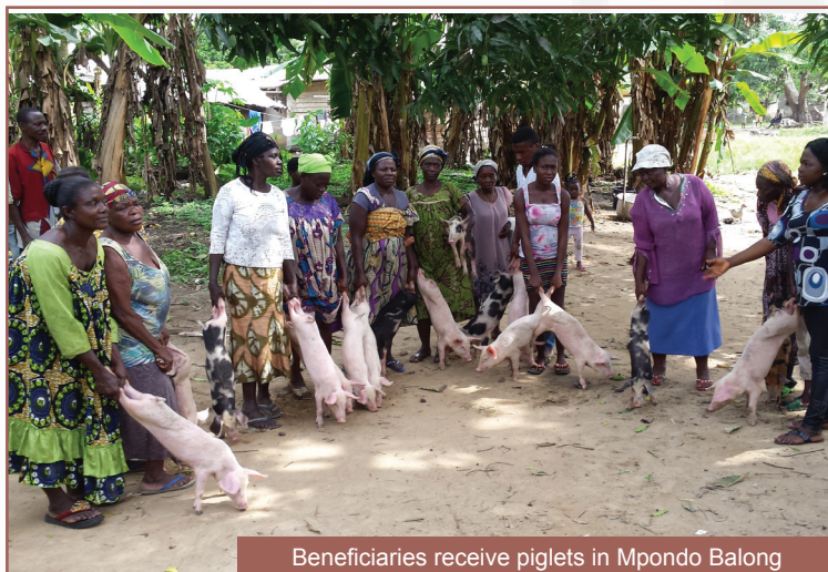
Beneficiaries receive piglets in Mpondo Balong