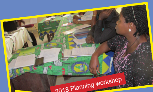
2018 Planning workshop