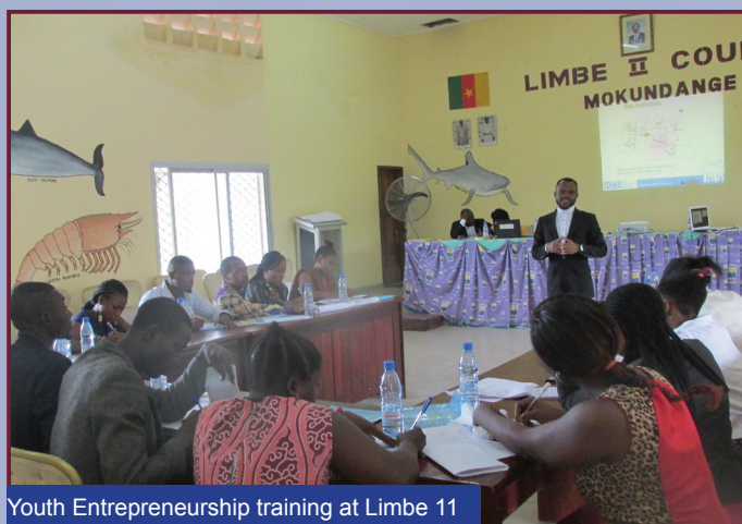
Youth Entrepreneurship training at Limbe 11

Working with the unique goal to build entrepreneurial skills as well as create employment opportunities for youths, the Nkong Youth Entrepreneurship Programme (NYE2P) extended from Kumba, Muyuka Buea, Limbe 1, Tiko as of Decem-