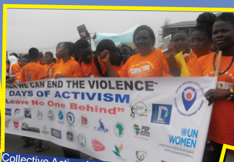
Collective Action Against Gender Based Violence in Buea