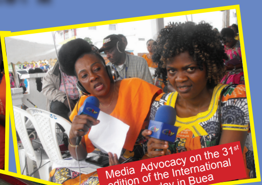
Media Advocacy on the 31 st edition of the International Women's day in Buea