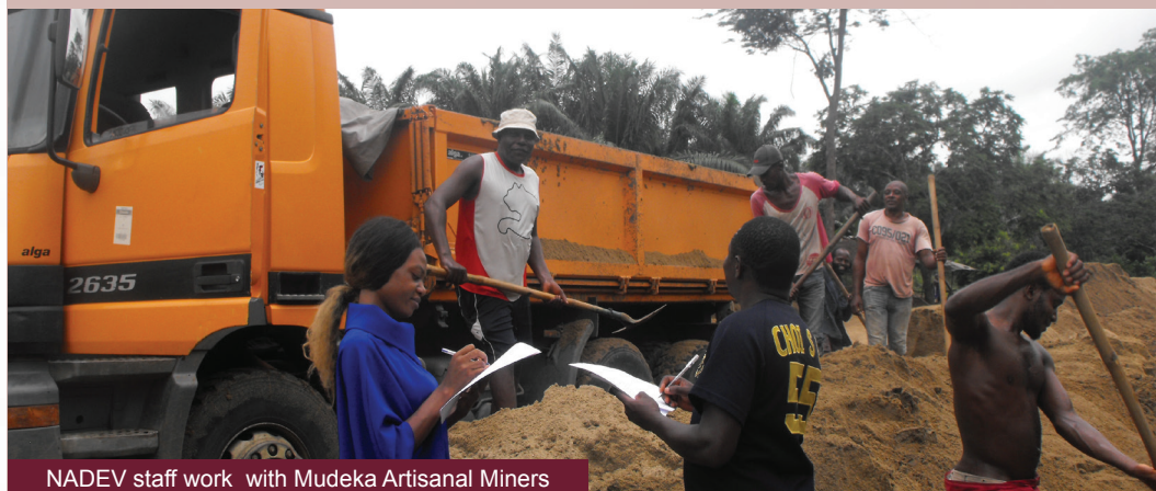
NADEV staff work with Mudeka Artisanal Miners

Cooperative creation among artisanal miners and artisanal miners' cards, capacity building on environmental, health, legal framework with regards to mining activities, entrepreneurship and data digitization are some supports that NADEV is currently rendering to four artisanal miners sites in the South West and North West Regions of Cameroon.