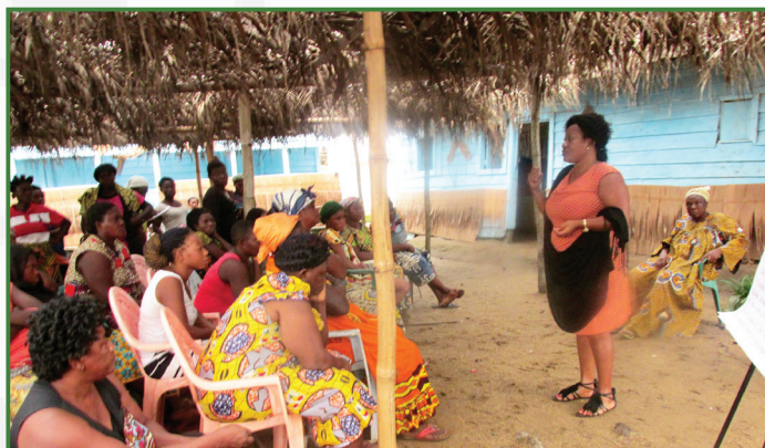
Gender and Widows Rights sensitization in Modoni, Fako division

The quest for gender equality and widows' rights remains one of the major preoccupations of NADEV due to prejudices such as early marriages/forced marriages, reproductive rights issues, widowhood malpractices and others.