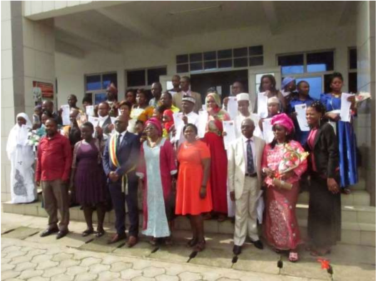
NADEV staff with Couples at the Buea Council Hall

NADEV in partnership with the Sub Delegations of Women Empowerment and the family in Buea and Muyuka respectively supported fifty (50) couples formally living in free unions to legalise their marriages. This has been part of NADEV's gender base violence advocacy over the years, in order to reduce such ills as violent relationships, cohabitation, teenage pregnancies and among others.