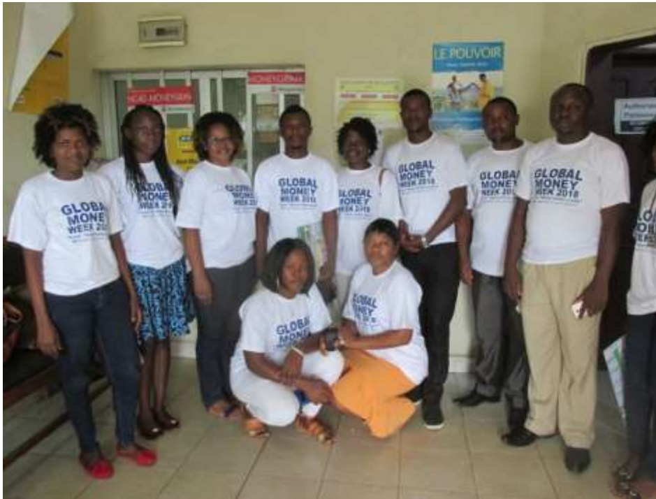
Visit to NKong Credit for Development (NC4D) during Global Money Week

In March NADEV joint the rest of the world to commemorate The Global Money Week under the theme “Money Matters Matter”. Activities that marked the event first time ever in Buea were seminar on Financial education, visits to financial institutions, TV and radio talks. Youths were brought together, and some reached through the media with financial literacy activities. Main areas of focus were budgeting, savings, investment, entrepreneurship and wealth creation. The main goal was to motivate youths to make smart financial decisions. The global Money Week is an Initiative of the child and Youth Finance International, with whom NADEV is partnering.