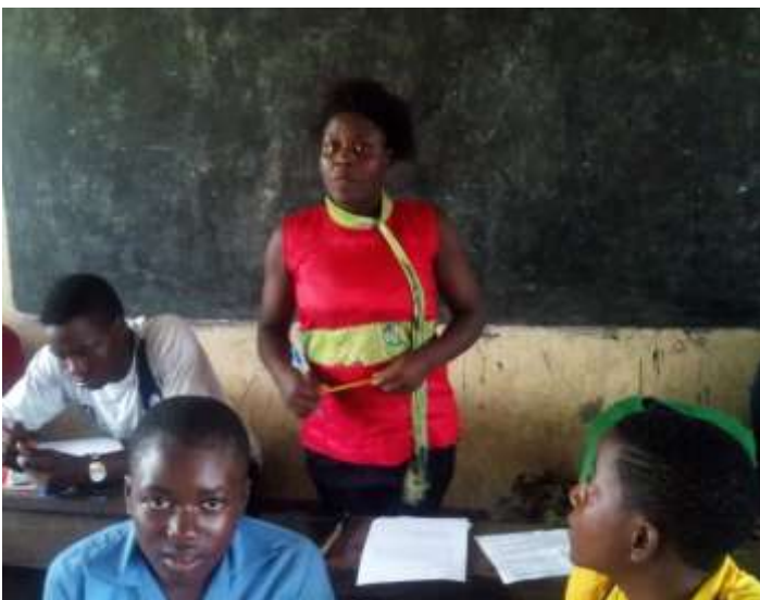
Participant sharing her experience with her parents when she became pregnant as a teenager and how it is affecting her now.

NADEV added Sexual Reproductive Health and Rights Workshops in its 2018 Operational Plan to sensitise young girls about the dangers of teenage pregnancy; to improve teenage girls' knowledge on reproductive health and sexuality, assist them in changing their behaviour and making healthy decisions and to examine values and attitudes towards gender relationships. These were inspired by the fact that 11% of all births result from teenage pregnancies, with 95% of these births occurring in low and middle income countries. In Cameroon about 12% of all births are attributed to adolescent mothers, as reported by the WHO fact sheet 2014. Pregnancy in adolescence is associated with higher risk of caesarean deliveries, low infant birth weight, neonatal asphyxia and prematurity. It is against this background that NADEV organised a 3 day workshop in Tole and Batoke respectively under the theme "The Impact of Teenage Pregnancy on our Society, What Way Forward?" The attendance at these workshops which stood at 70 was aimed at exposing the dangers of premature sex in order to reduce the rate of teenage pregnancy in the above-mentioned villages. Today youths in Tole have taken it as a challenge to sensitise themselves and their parents on the need to help children stay away from situations that could lead them to into premarital sex.