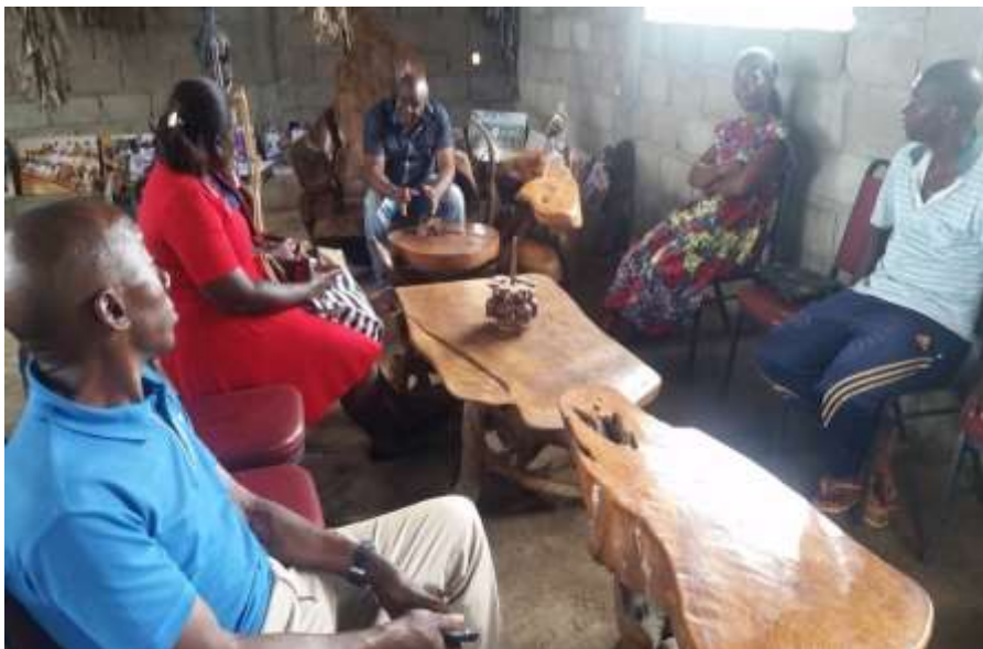
NADEV staff present at the Bonganjo Chief's palace on invitation by the Chief to assist in the planning of a restitution meeting in his village.

Prominent on all participants' action plans was to hold restitution meeting with traditional council members and consequent plan to abolish all negative traditional practices in their respective communities.