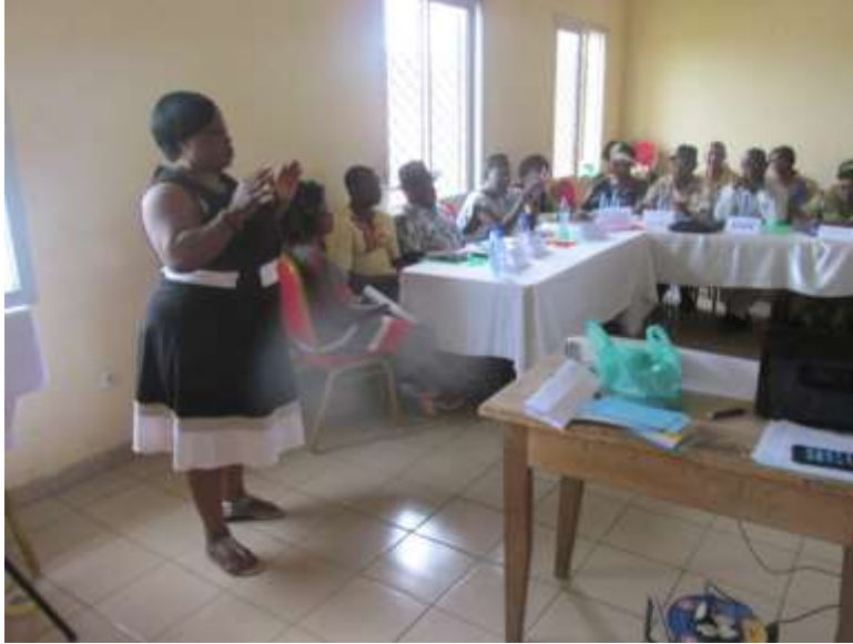
A cross section of participants actively listening to the facilitator

Prominent on all participants' action plans was to hold restitution meeting with traditional council members and consequent plan to abolish all negative traditional practices in their respective communities.