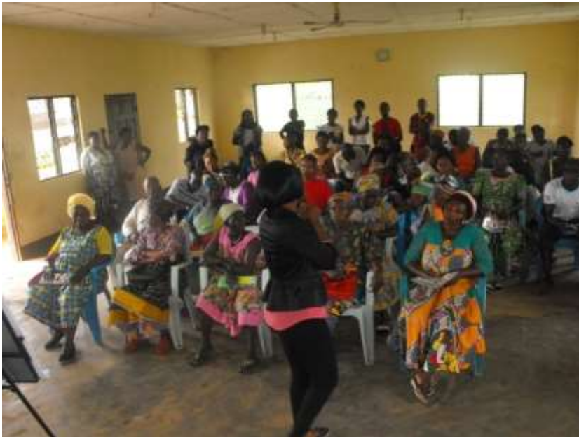
Gender and Widows right sensitization workshop in Batoke village.

A number of villages to include Ombe, Mondoni, Batoke, Debuncha, Ngeme, Bimbi, Botaland, Bonamanja, Bongajo and Motombolombo were reached with sensitization workshops on Gender and Widows Rights. Activities started with a baseline survey to determine the level of community understanding of gender issues. Women, men, boys, girls were brought together to identify some socio-cultural practices that hamper women's progress in communities. These workshops enabled participants learn about widow's right and came out with action plans to reduce the plight of widows.