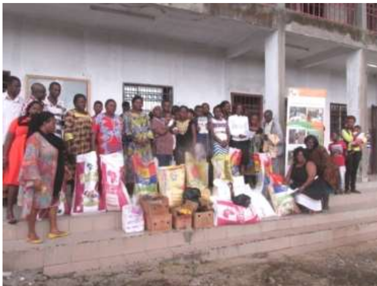
Group photo with IDPs at Head Office

The NADEV’s Josephine Tita Memorial Trust (JTMT) donations reached some 21 IDPs with gifts of food and non food items in the month of July. NADEV used the opportunity to mobilize funds through the JTMT from members and people of good will in the in an around the country to support IDPs in the Buea Municipality. This activity took place at NADEV head office Molyko