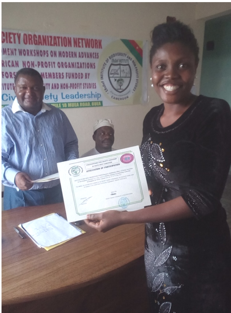
NADEV staff took part in two training workshops on Fund Raising Strategy organized by SWeCSON for its members in Fako and Meme Divisions respectively