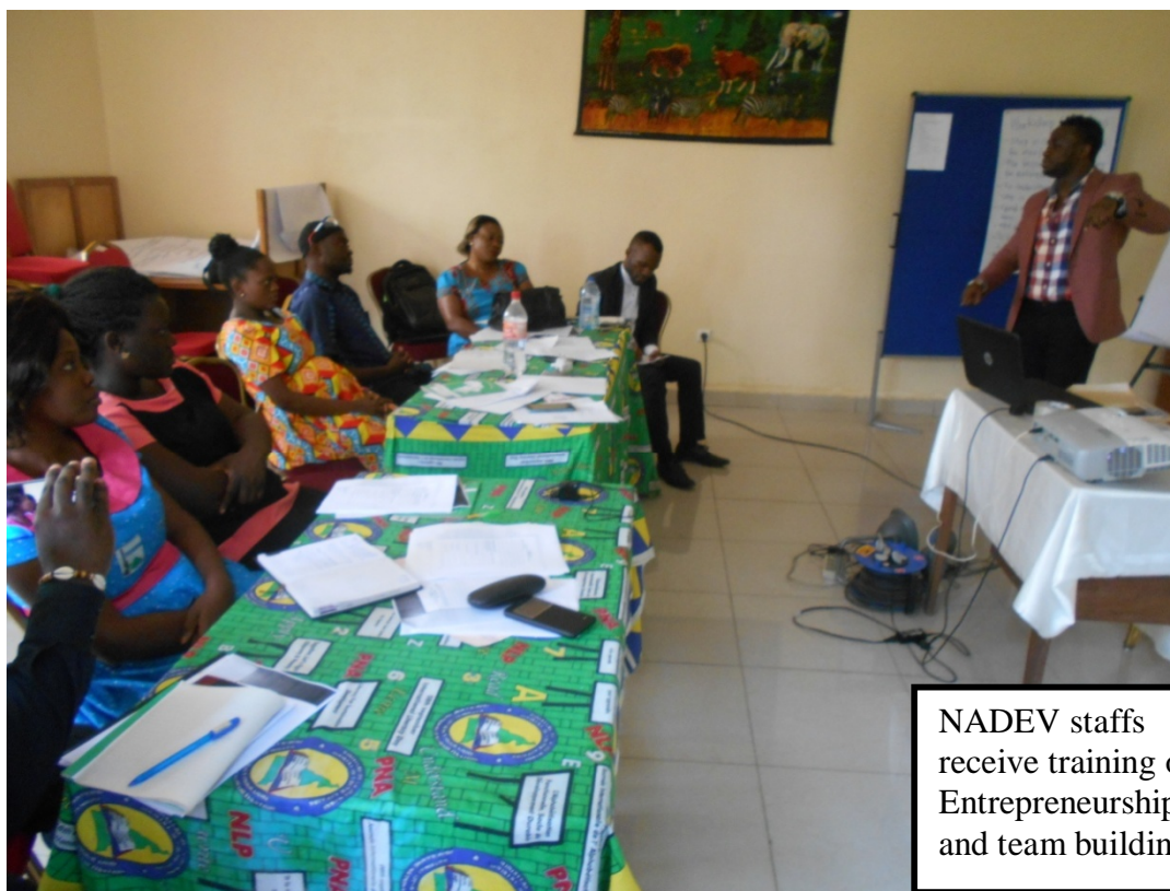
NADEV staffs receive training on Entrepreneurship and team building

During the year 2017, NADEV attended and also organized in house capacity building for staff empowerment and development as seen below: