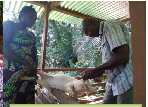
Piglets being vaccinated at installation in their pens