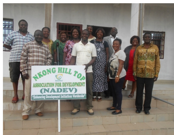
A cross section of Board and staff of NADEV

We also have space and Equipment for training and meetings at our new head office in Molyko, Buea.