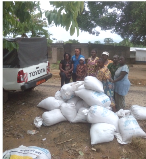
NADEV delivering pig feed to beneficiaries in Ayong village