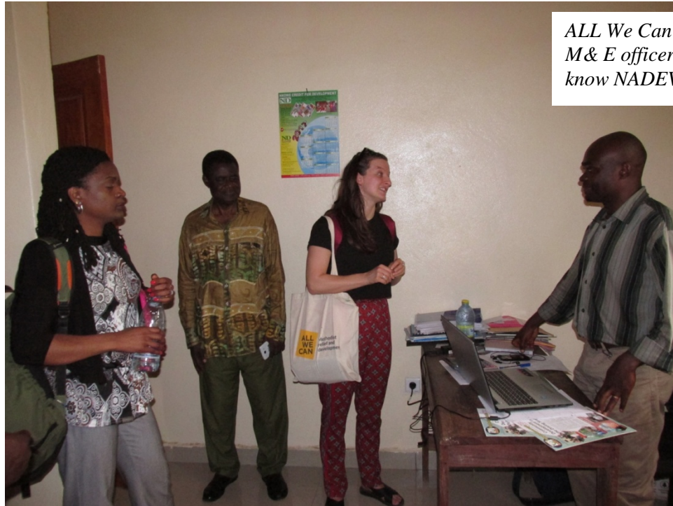
ALL We Can's new M& E officer gets to know NADEV staff

Once again All We Can mrd visited NADEV which provided the opportunity to introduce the new M&E Officer and give her the chanceto ascertain realities about NADEV and its activities with All We Can for the very first time.