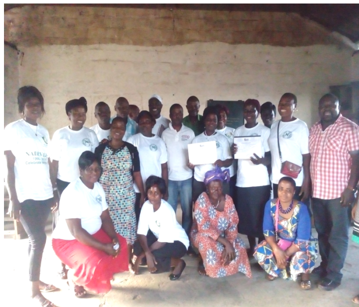
Family photo of Mautu Dynamic Agric Maize Farmers Cooperative brandishing their newly acquired Cooperative certificate

Within the context of Sustainable livelihood, agriculture and livestock development, NADEV engaged in promoting Cooperatives among farmers. By 31 December 2017, with the support of NADEV, 02 Cooperatives files were harmonized in accordance with the OHADA Law on Cooperative Formation and Management. Among these were two newly created Simplified Cooperatives – The Mautu Dynamic Agric Maize Farmers Cooperative and the Ikilinwindi Pig Farmers.