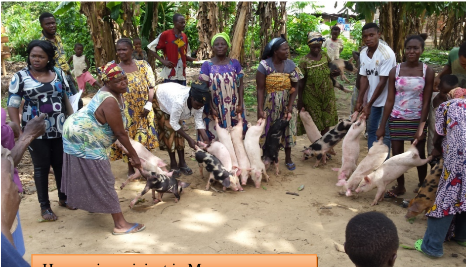
Happy pig recipient in Manyemen, Manvu Division